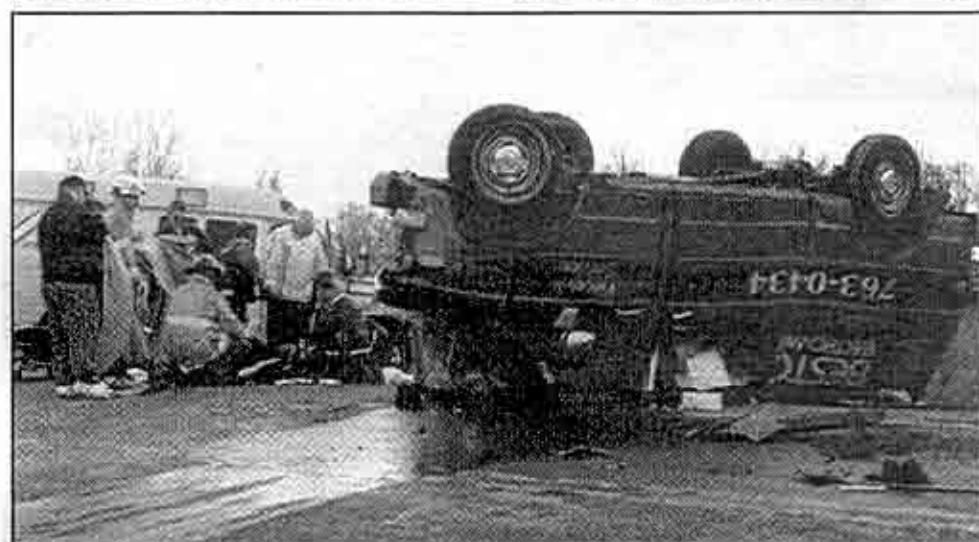
Police and ambulance personnel were quick to answer the call to the scene of the crash.