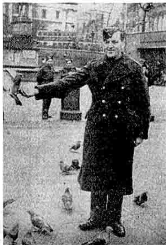
Fond of Horses -- Likes Pigeons Too